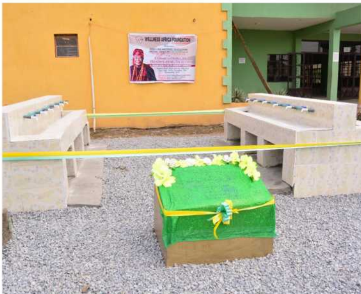
Baptist Boys' High School, Saje