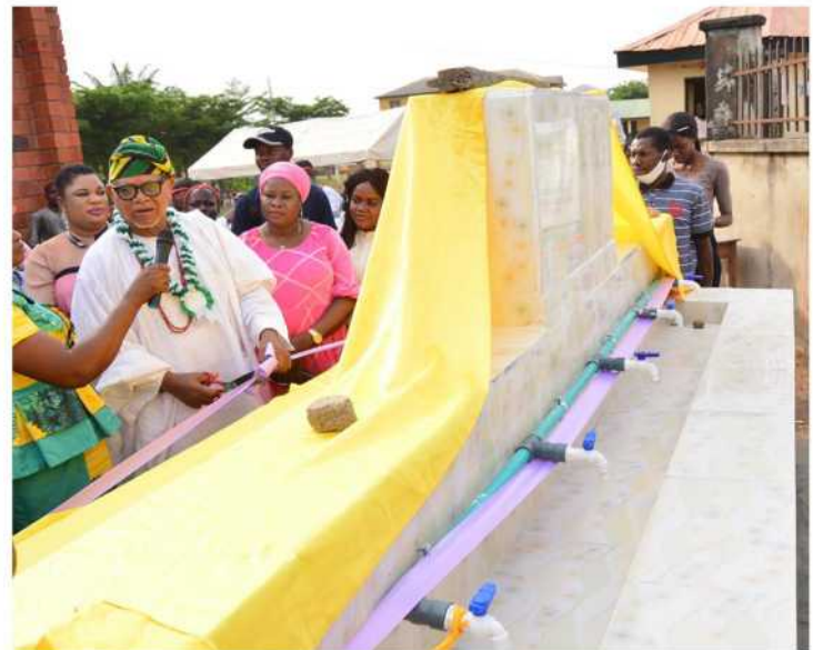
Daniel Akintonde Model School for Children with Special Needs, Adigbe